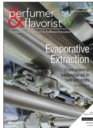
Optional Cover Branding - Corner