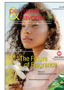
Final Cover Image - Enlarged and cropped to fit vertical format.