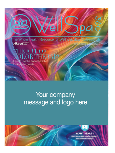
Digital Belly Band