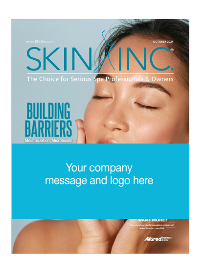
Digital Belly Band