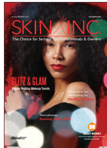
Final Cover Image - Enlarged, cropped and flipped to fit the vertical format.