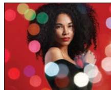
Original Image →

Designers work with each image to arrive at a final cover. Here are the original images and how they can be manipulated for use. All covers are vertically oriented.