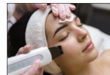
Original Image →