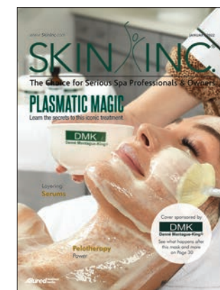
Optional Cover Branding - Circle