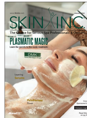
Optional Cover Branding - Corner