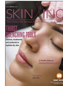
Final Cover Image - Enlarged and cropped and flipped to fit the vertical format.