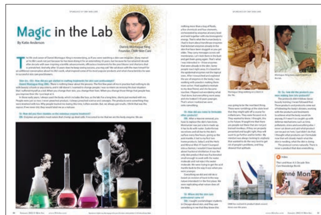
Example 4-Page Folio